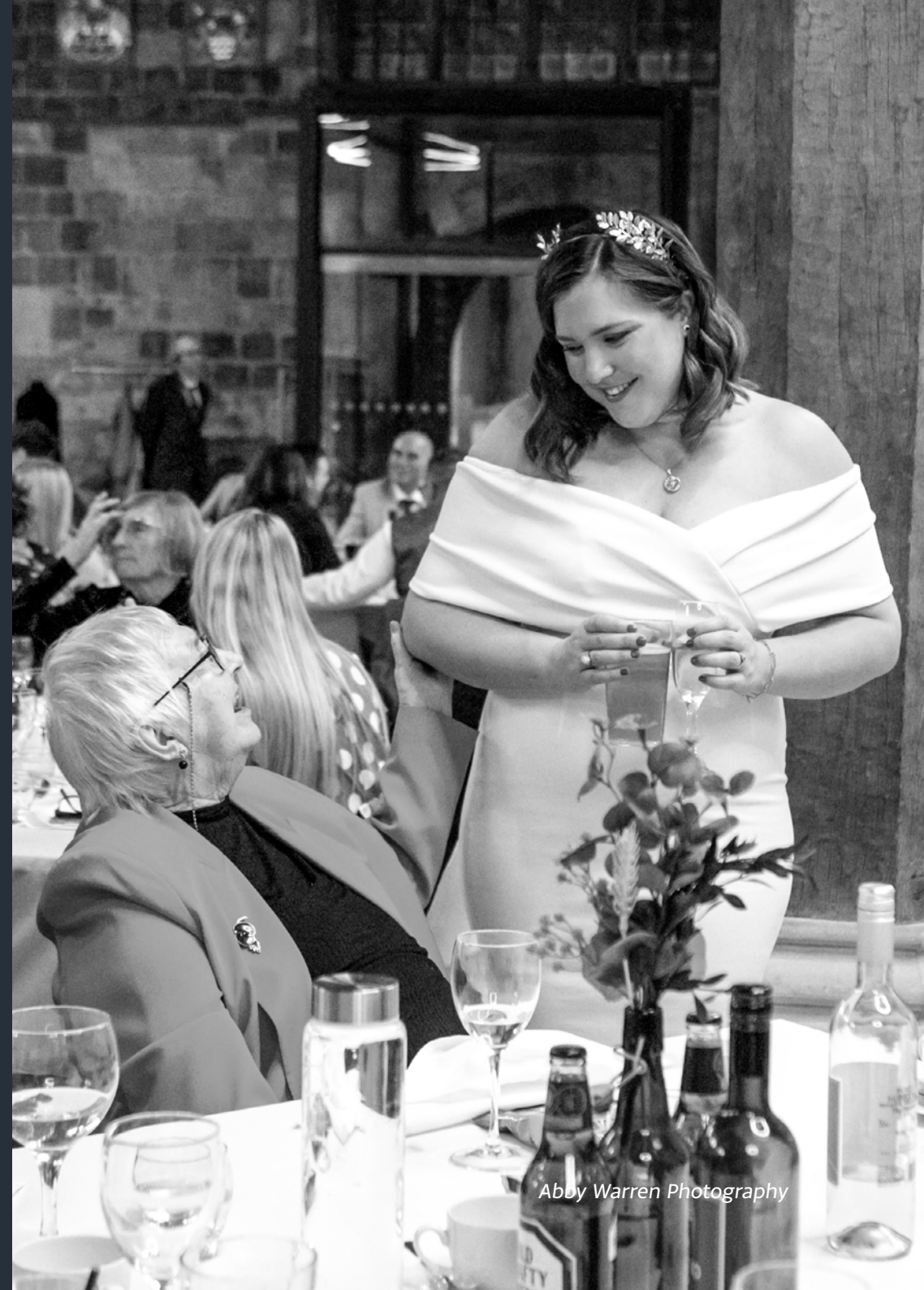
Abby Warren Photography

Planning your wedding should be fun and exciting, match your style and be a true representation of your personality as a couple. Our wedding coordinators will personally ensure that all your special requests and requirements are taken care of. It's our duty to make sure your day runs smoothly so you can enjoy it all the more.